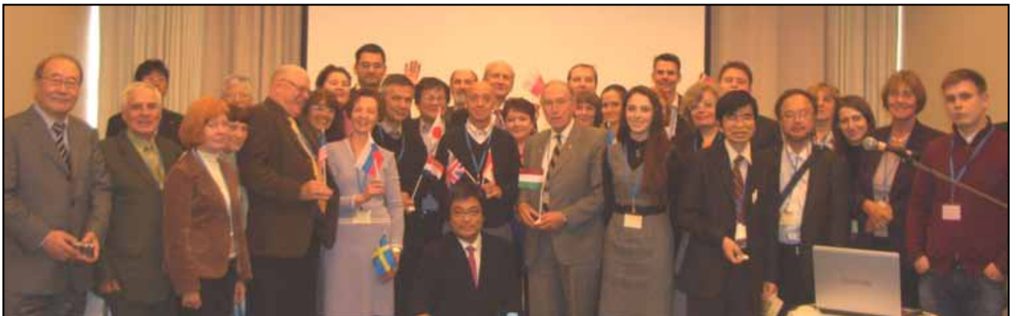
The participants of Session 1